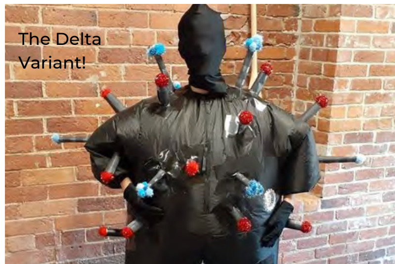
The Delta Variant!