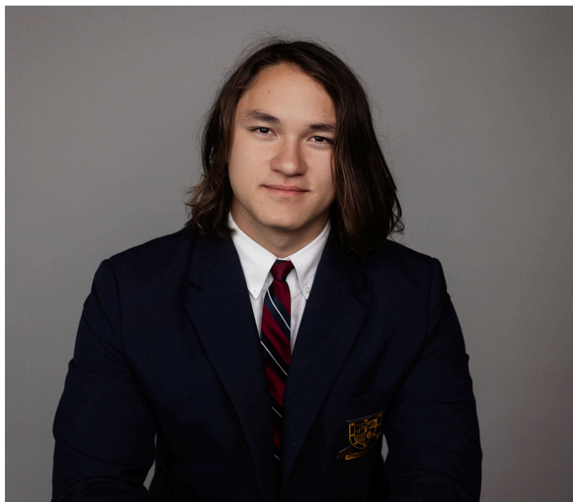
Jacob Schulich Leader Scholarship Nominee