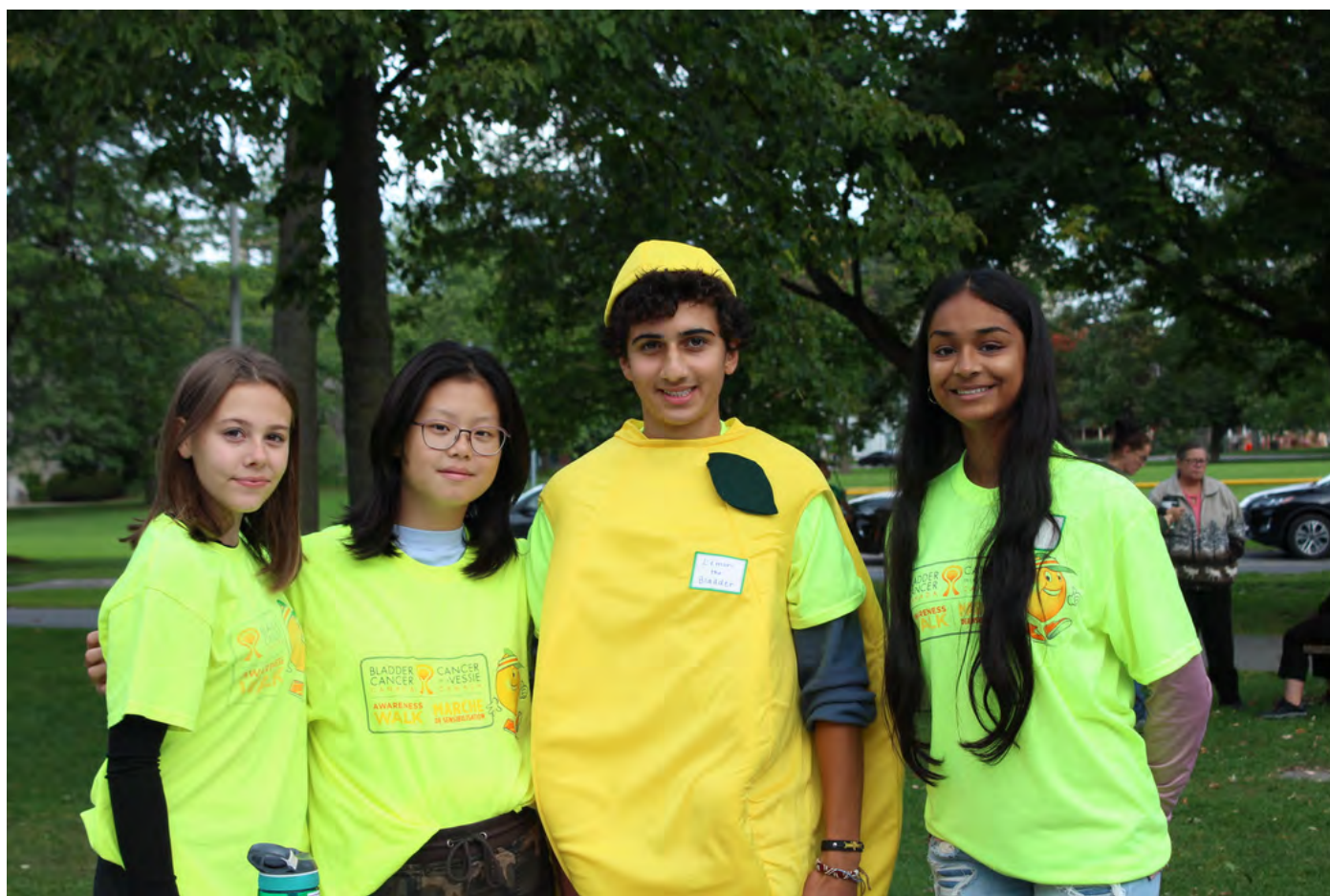
Some of the volunteers from Leahurst at the Bladder Cancer Awareness Walk!